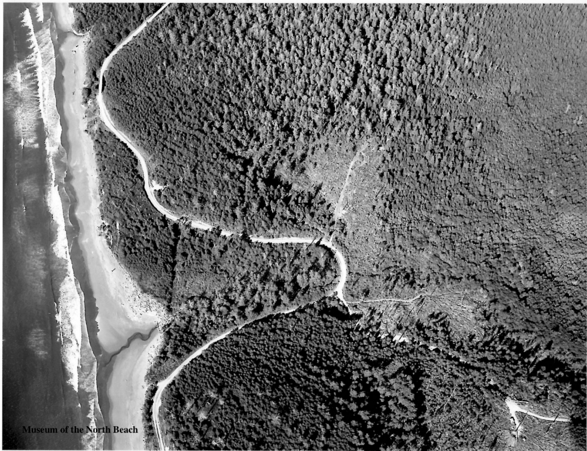
Aerial View of the Former Bezzo Homestead and Today's Seabrook, August 27, 1949